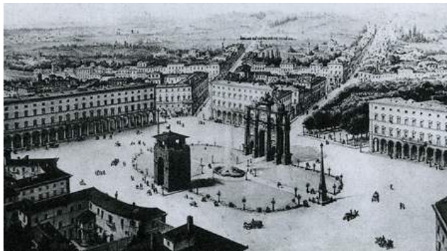
Figure 2 – Project for Piazza della Libertá, Florence.

proper structure for planning controls and peripheral offices of the Ministry itself were able to provide reasonable support to the implementation of the Town Planning Act of 1942. Also, Planning education had started, with postgraduate courses not too dissimilar to planning courses in the economically most advanced countries in Europe. The recognition of INU could be the first step for establishing a planning profession in the same way as the British Town Planning Institute. Planning experience in Italy was not negligible. From 1865, with the Town Plan for Florence (Figure 2), up to the most recent "Piano Regolatore" for Milan and for Rome in 1928 and 1932, there existed a solid base for a more generalised approach. Also the new towns, created by the Fascist Regime (Figure 3), were important pioneering experiences at that time, even though their impact was vitiated by their reactionary ideological content.