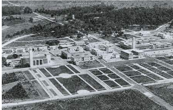
Figure 3 – Sabaudia: aerial view of the City Council Park.