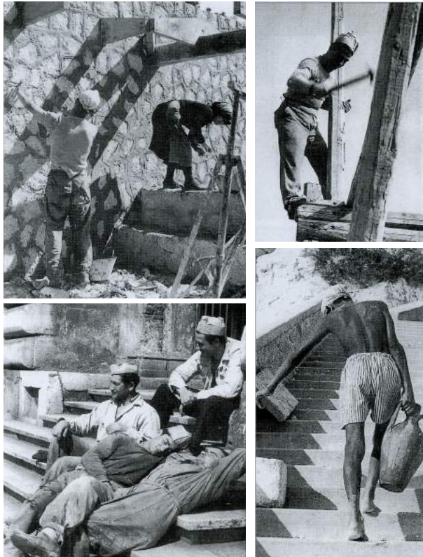
Figure 5 – Low-tech building sector: Engine of economic growth (Source: Camerini et al, 2000).

could induce development in many sectors of industry (Figure 5). All this was supported by huge housing deficit. On the other hand the demand was inflated by industrial development itself, attracting more and more manpower from the country into industrialised metropolitan areas. Bardazzi (1984) has shown the close correlation between post-war planning legislation and the trends of the building industry. The conclusion is that the real aim of planning legislation was to support the building industry more than setting up an efficient planning system.