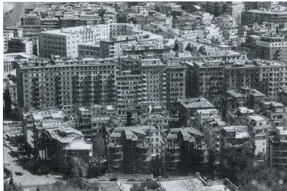
Figure 6 – Example of illegal development.

On the other hand, in the '80s, there were attempts of a substantial deregulation in planning. The most important step towards deregulation was the so called "building condono" through a specific act (47/1985). This Act concerned past abuses. Those owners possessing a building which did not correspond to the planning tools at the time they were built (PRG, PdF or Regolamento Edilizio) could regularise it by paying a fine in relation to the size of the abuse and the time it was committed (Figure 6). This would cancel also any penal consequence for the owner. Officially, the two main reasons for the Act were to allow some order into the matter of planning abuses and to give the possibility of restarting a more effective development control. On the other side there was the possibility of revenue to finance part of the Central Government's deficit. The forgiveness of planning sins can be seen in the long tradition of the "seller of indulgences" for which Rome became famous in the past; the obvious and strong opposition by INU and conservationist groups could not stop the Act.