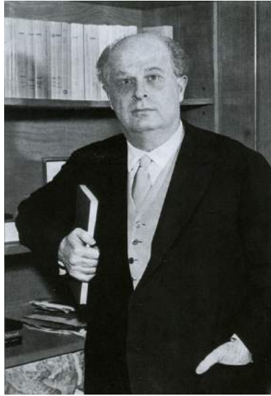
Figure 1 – Adriano Olivetti (Source: Urbanistica , 30, 1990).

A general picture of town planning in Italy must be seen in the particular atmosphere which has developed since the war; and must be introduced by a reference, however brief, to town planning activity as it was carried out in this country during the decade preceding the war. Without this, the foreign observer, examining aspects of present activity, might either form too optimistic an opinion by considering isolated achievements, or a pessimistic one by judging only from the official results of plans. In either case he would lose sight of the significance of the slow and difficult process which was clarifying and transforming town planning in Italy; and for the foreign observer, who is in a position to make comparisons with other countries, this is certainly its most interesting and striking aspect. With Olivetti passing away, however, Italian planning lost any form of appeal to the eyes of non-Italian planning scholars. The figure of Olivetti was important in the international context, and perhaps even more so than in Italy. In announcing his death, the editorial in the Town Planning Review , written by Paolo Radogna, a student of the Department of Civic Design, underlines the sense of Olivetti's message and his role within Italian planning: