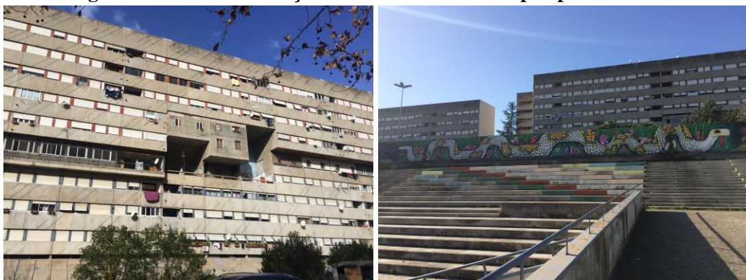
Figure 3 - Photos of the façade of Corviale from two perspectives

In the original project, the residential floors were interrupted in the middle by a “free floor” (as called in Fiorentino, 1974) that was dedicated for commercial services. The floor separated different residential types. On the upper floors, the houses are distributed by galleries and accessed through the five main staircases. The lower floors contain in-line houses that are connected by secondary staircases. The two typologies can be identified by the colours around the windows outside: red for the first ones, and blue for the second ones.