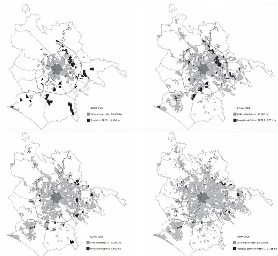
Figure 4 - The dark grey zones contain the plans for the I PEEP (1 - 2 maps) and II (3 - 4 maps)

The squatters were regularized some years later, while the public houses had been built nearby so that the services and the infrastructures were used by both.